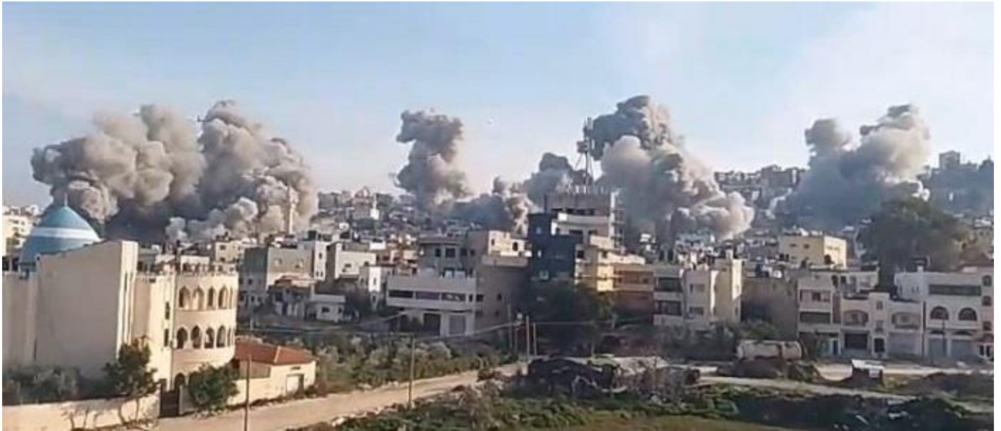
This is not in Gaza, it's in Jenin-West Bank

The West Bank has entered a new phase of suffering and atrocity. Invasions of various areas, particularly in the northern districts, have reached unprecedented levels. The use of helicopters to launch rockets into densely populated refugee camps and the bombing of 15 buildings at once are something never witnessed in the West Bank. Settler violence and attacks and the reveling of the plans to annex west bank and acting accordingly is also dangerous precedent. This is evident in the staggering number of checkpoints imposed within the West Bank, now reaching 900, making daily life nearly impossible for millions.